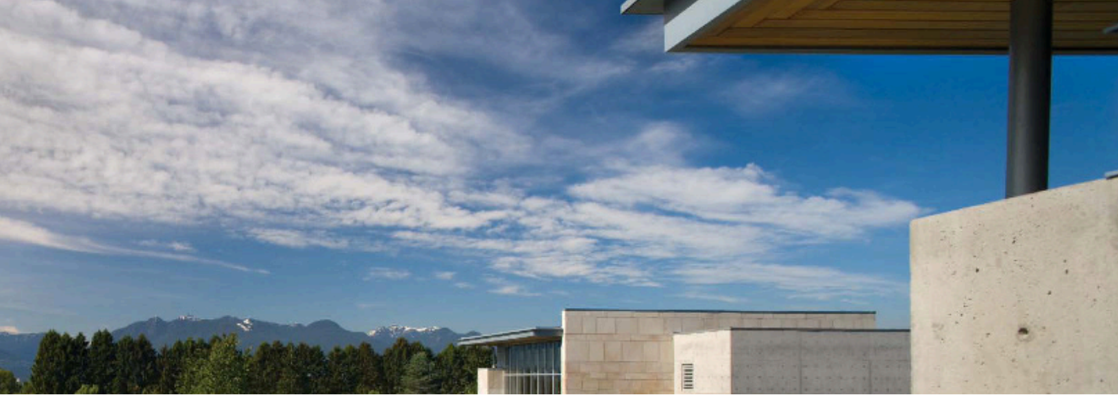
Mountain View Cemetery, Vancouver - looking North over the Celebration Hall [design team - Birmingham & Wood Architects]